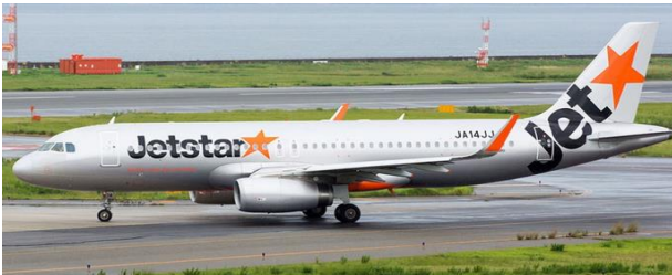
BL Jetstar Pacific