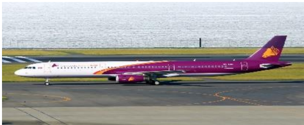
K6 Cambodia Angkor Air