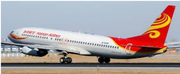
NX Air Macau