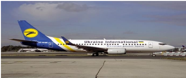
PS Ukraine International Airlines