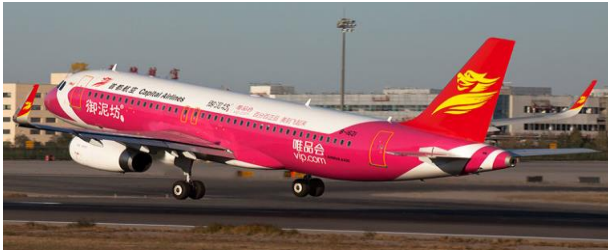
JD Beijing Capital Airlines