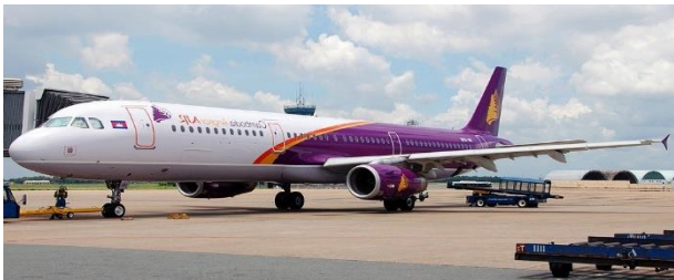
K6 Cambodia Angkor Air