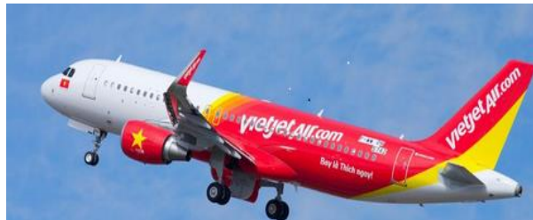
VJ Vietjet Air